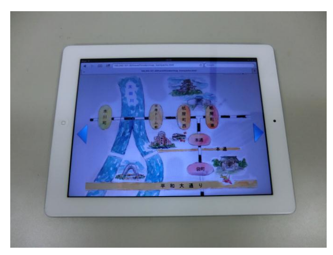
Figure 1. A snapshot from our system on the iPad.

In this section, we describe our prototype system. Fig. 1 is a snapshot of its behavior on the iPad. The system operates with a browser.