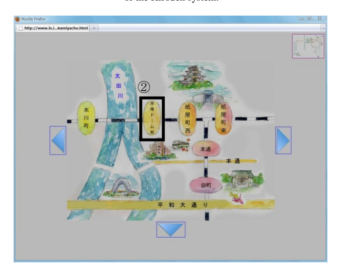
Figure 3. A portion of the route map, enlarged.